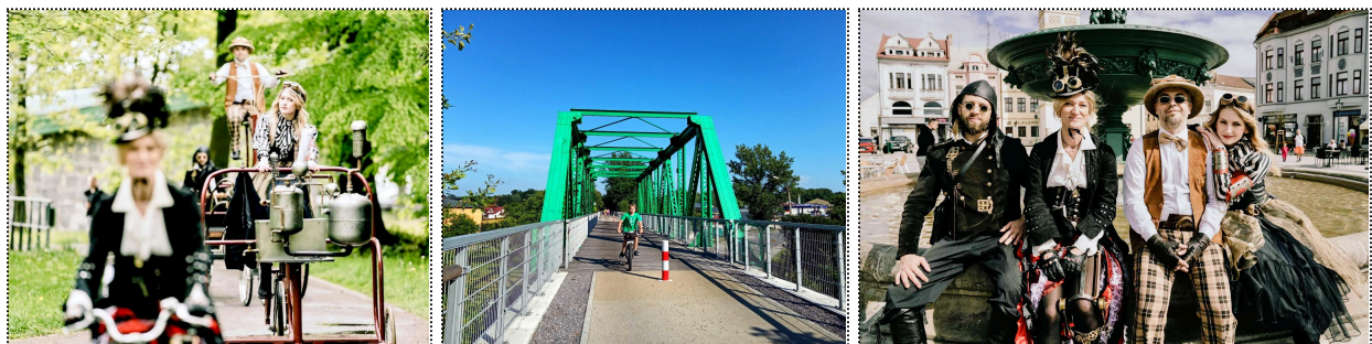
Iron Greenway Festival—Poland and Czechia, Cieszyn / Těšín Silesia

>>> Cross-border Bicycle Festival on Iron Greenway in Poland and Czechia