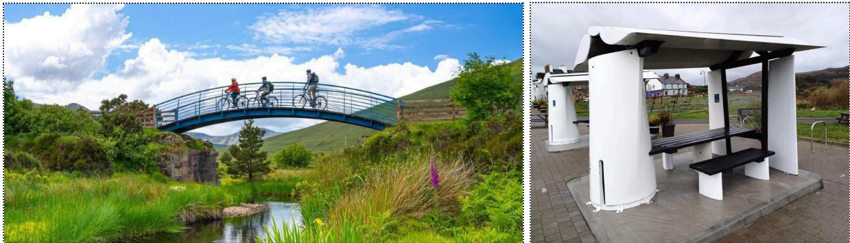
Great Western Greenway, Ireland / Picnic shelters made from recycled windmill blades

Share and promote good practices that demonstrate how green infrastructure—such as greenways, cycle routes, and other non-motorised itineraries—contributes to environmental protection, while exemplifying circular economy principles in practice .