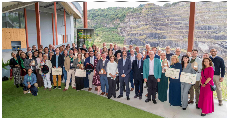
12th European Greenways Award 2025, Spain, Abanto-Zierbena, Basque Country, photo: ©basquetour.eus