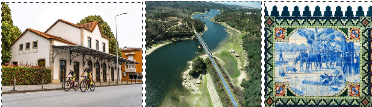
Ecopistas in Portugal, photos: ©Ecopista Tâmega & Corgo, ©ipatrimonio.pt