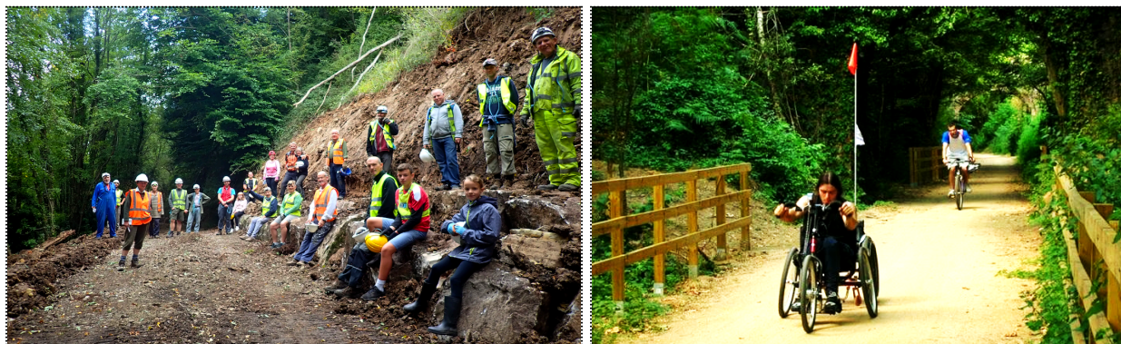
Greenways and Cyclerooutes volunteer workcamps in the UK / Greenways accessible for All, Girona Greenways

In the United Kingdom, the Greenways and Cycle Routes Ltd. uses volunteer workcamps to support the development of walking and cycling routes. Volunteers from all generations take part in activities such as building bridges over waterways, constructing abutments for road bridges, installing bat-friendly lighting in tunnels, and casting and installing new copings for railway viaducts. This approach fosters a strong sense of local ownership of the routes and helps train volunteers to develop, maintain, and manage the infrastructure in the long term 9 .