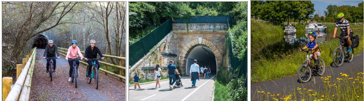
Examples of Greenways in Spain, Italy and Ireland, photos: ©viasverdes.com, ©comune.roma.it, ©Royal Canal Greenway

Greenways are communication routes reserved exclusively for non-motorised travel , developed in both urban and rural areas across Europe. By reusing disused or “recycled” infrastructure—such as former railway lines, towpaths, and historic heritage trails, including industrial heritage—they respond to increasing social demands, including access to nature and culture, ecotourism and active tourism, healthy outdoor leisure, and sustainable mobility , while contributing to the fight against climate change .