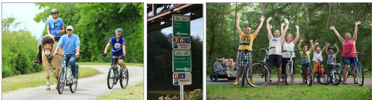
RAVeL network in Wallonia, Belgium, photos: ©ravel.wallonie.be

The integration of non-motorised transport routes , including greenways and cycle routes, into the broader transport network is essential to promote the decarbonisation of transport and to support the development of sustainable tourism and mobility . This zero-emission network contributes to the diversification of tourism offerings and the extension of the tourist season , providing alternatives that help prevent overcrowding in popular destinations .