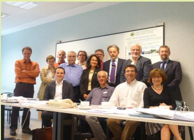
Picture: EGWA members with the Director of Tourism of the European Commission, in the last General Assembly, in Brussels (2009)

~ EGWA General Assembly, Seville (Spain) March 22 nd , 2011