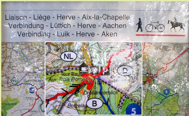
Picture: Towards Aachen, panel of the 3 borders

Co-founder of the European Greenways Association (EGWA), the Belgian association Chemins du Rail (chemin du rail = rail-trail) contribute very closely to the development of the RAVeL, the greenways network of the Walloon Region, and of many local projects connected with slow mobility.