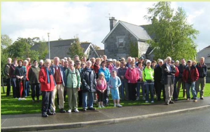
Picture: The GST Group at Newcastle West Old Station House on National Trails Day.

National Trails Day [Sunday 3rd October] was the occasion used to celebrate the latest extension to the Great Southern Trail (GST). In excess of 100 people of all ages from West Limerick, North Kerry and further afield enjoyed an 8 mile [13km] walk in pleasant autumnal conditions between Newcastle West and Rathkeale.