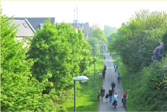
Early morning journey to school & commuters on traffic-free greenway through housing area (Bristol & Bath Railway Path, National Route 4).

12,600 miles, 407 million journeys by foot and bike, 3 million users. September marked the 15th Anniversary of the National Cycle Network. It carries more than a million walking and cycling journeys every single day.