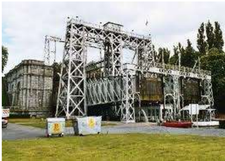
Boat lifts - Canal du Centre