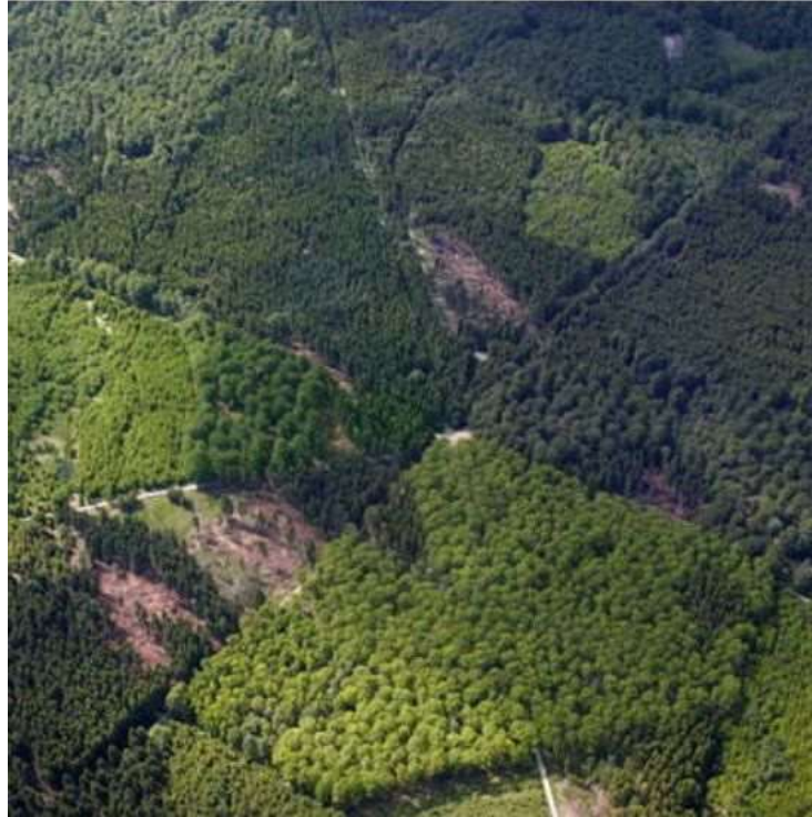
Parts of the Sonian Forest