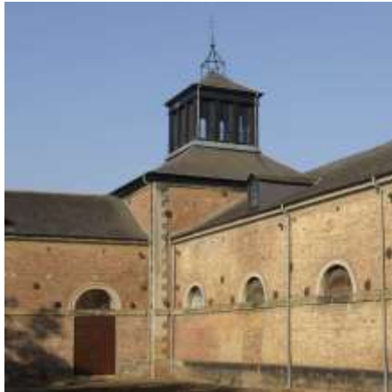
Le Grand-Hornu Bois-du-Luc Le Bois du Cazier Blegny-Mine