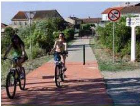
Cycle by night in Tourencinho