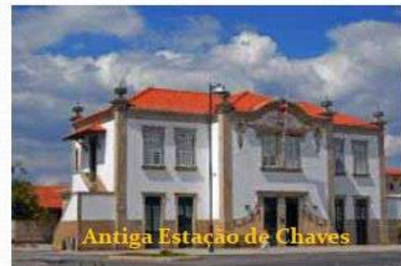
Antiga Estação de Chaves