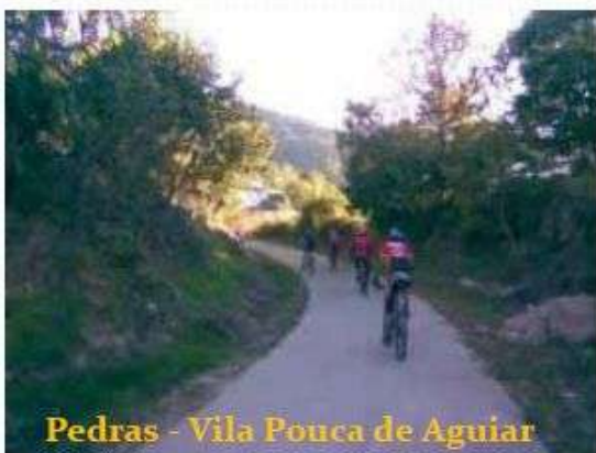
Pedras - Vila Pouca de Aguiar