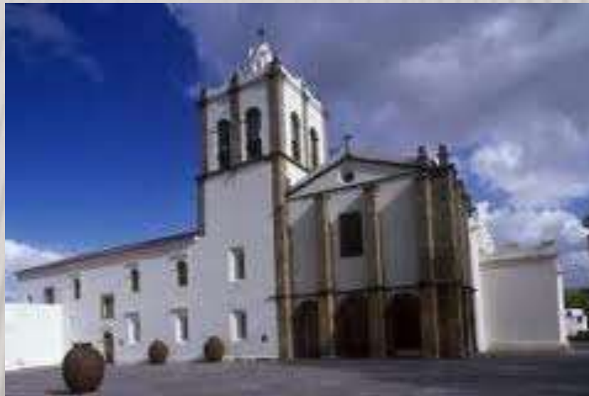
Pousada de Arraiolos, Ecopista de Évora