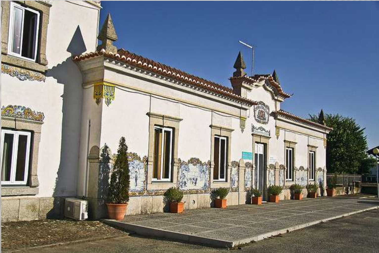
Estalagem Rainha D. Leonor, Cabeço de Vide