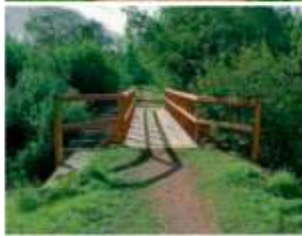
The Vijaši wooden bridge before and after renovation

inhabiting rivers and lakes. Green Railways wind through Gauja National Park and the North Vidzeme Biosphere Reserve, which feature diverse flora, springs, rocky outcrops, pretty landscapes, and other unique natural, cultural, and historical sights.