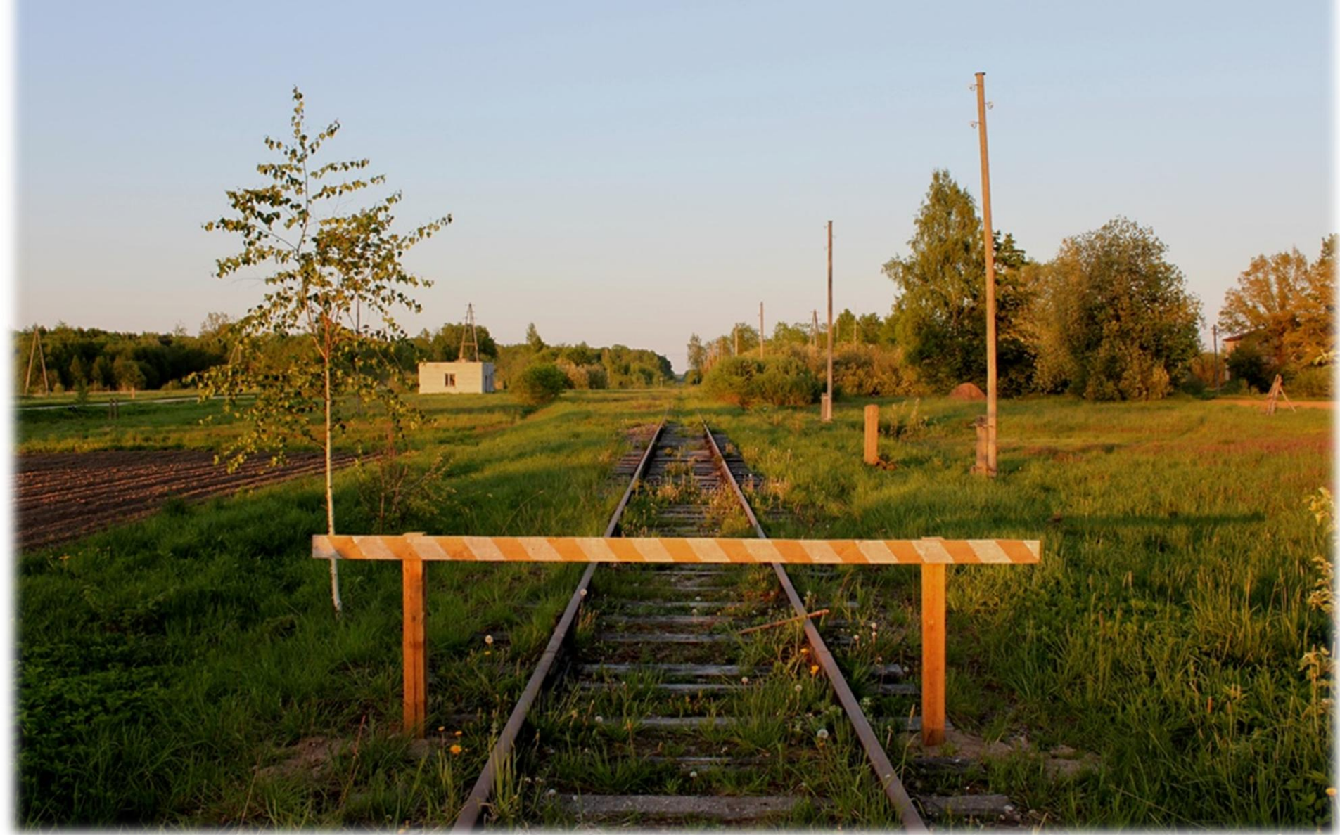
Keipenes cinema station – only preserved section of rails