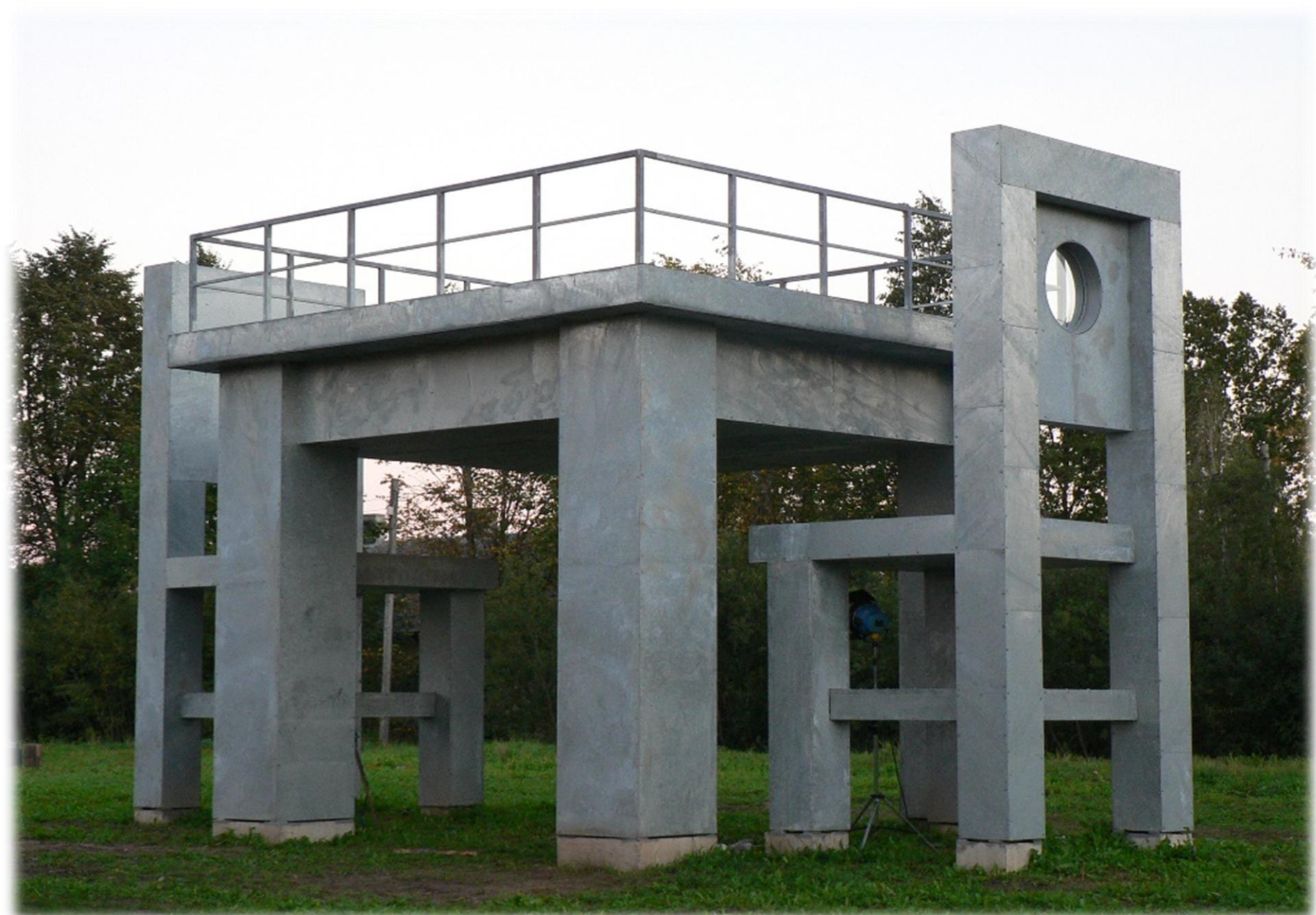
Cinema museum in the former railway station