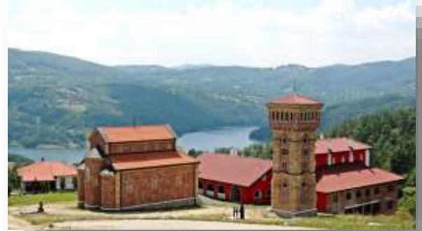
Monastery Rujan (1524)