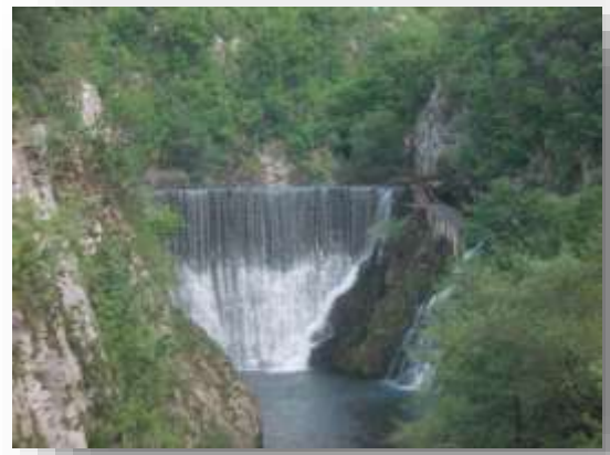
Dam on the Djetina river