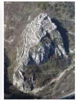
Old town from XII cent.